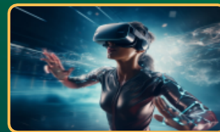
Virtual reality (VR)