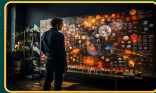
Internet of things (IOT)