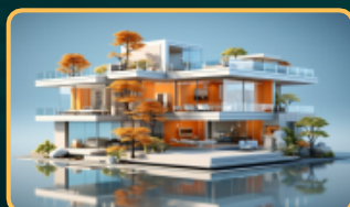
3d Modeling and Reconstruction