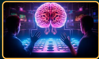
Brain - computer interface