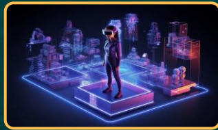
Augmented Reality (AR)