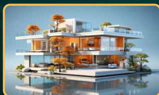
3d Modeling and Reconstruction