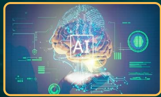
Artificial intelligence (AI)