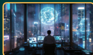
Spatial and Edge Computing