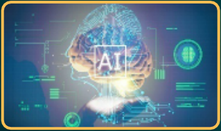
Artificial intelligence (AI)