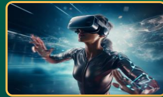
Virtual reality (VR)